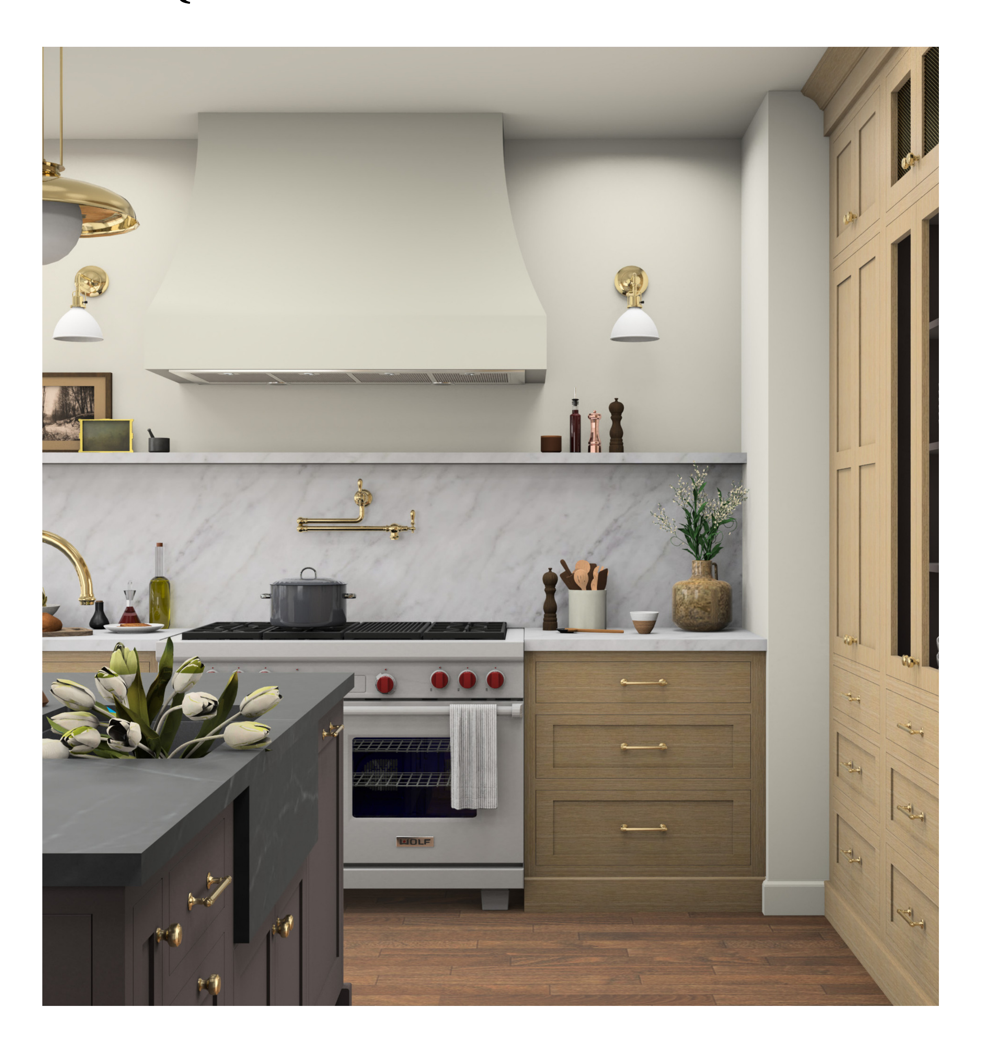
UKB Measuring Guide